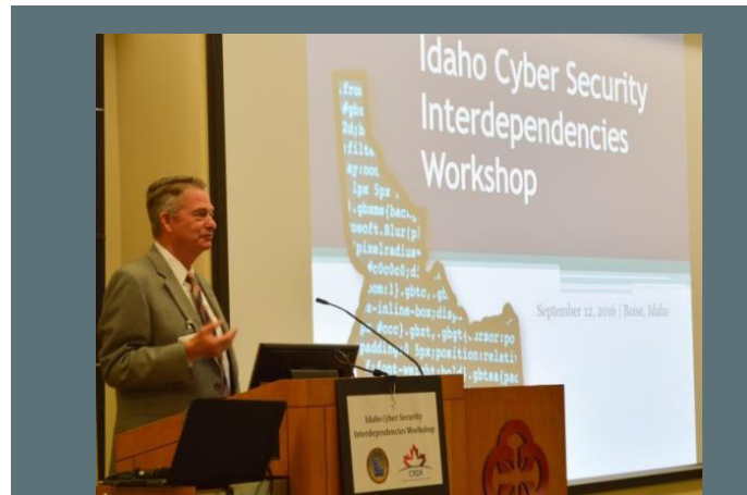
Lt. Gov Brad Little addressed participants on the importance of preparedness and collaboration